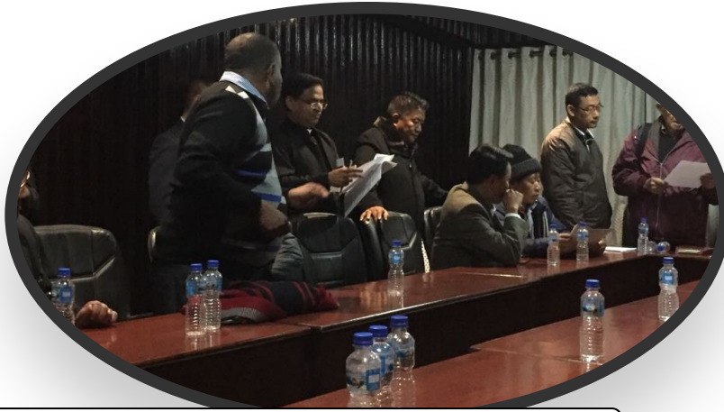
Training of Community and Religious leaders